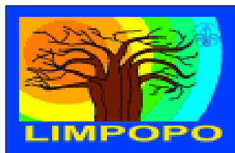
Limpopo's Provincial Badge

We want to see your stories, for example who won Mopani's District Poetry Award—A SCOUT